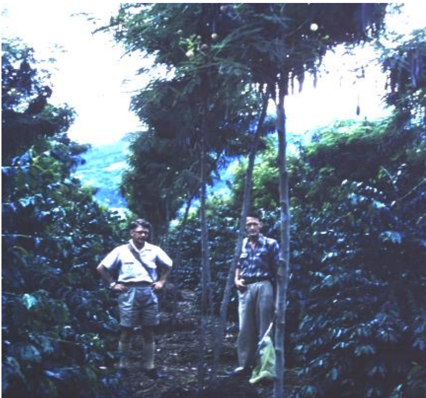
Coffee plantation PNG 1956