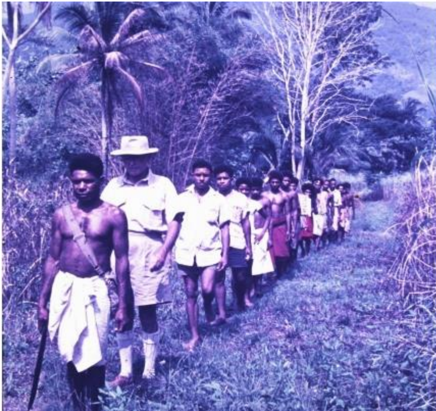
Plant Pathology - Entomology Expedition PNG 1957