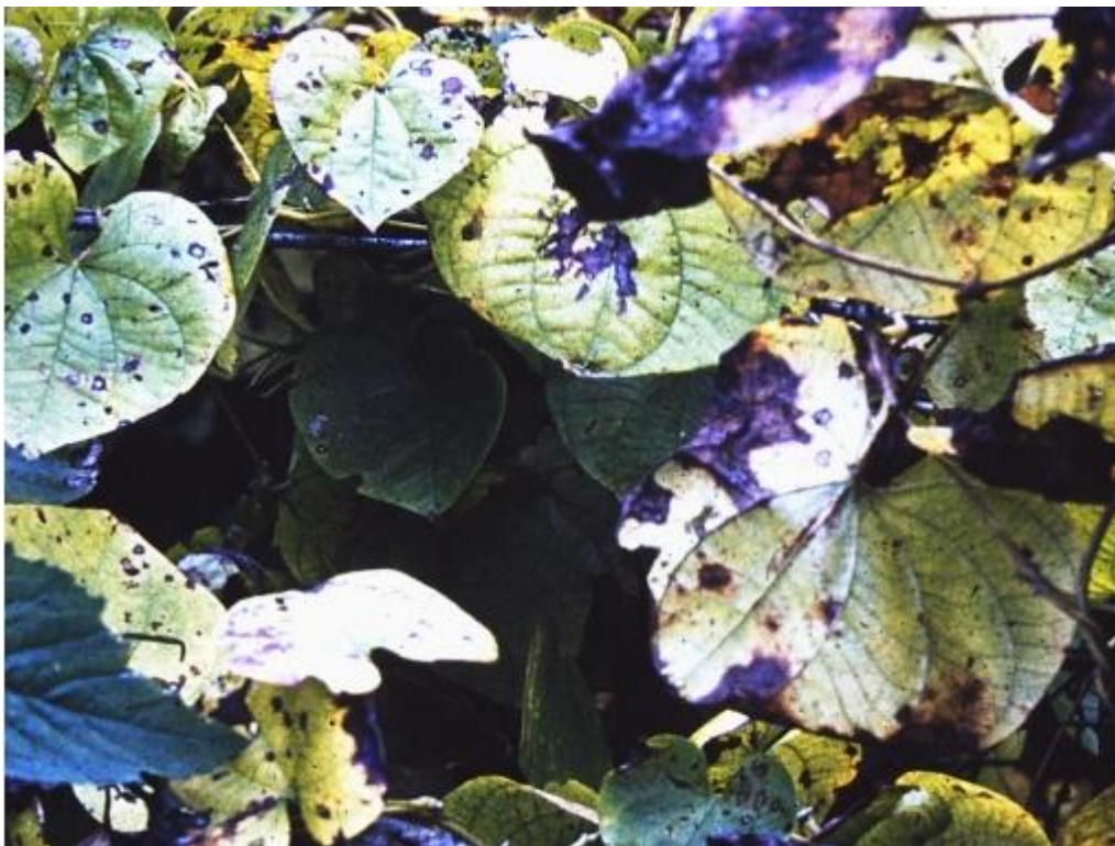
Sweet potato disease 1957