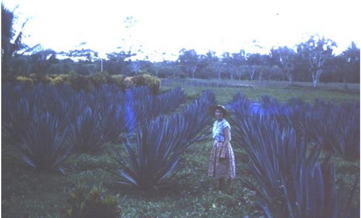
Sisal Plantation PNG 1956