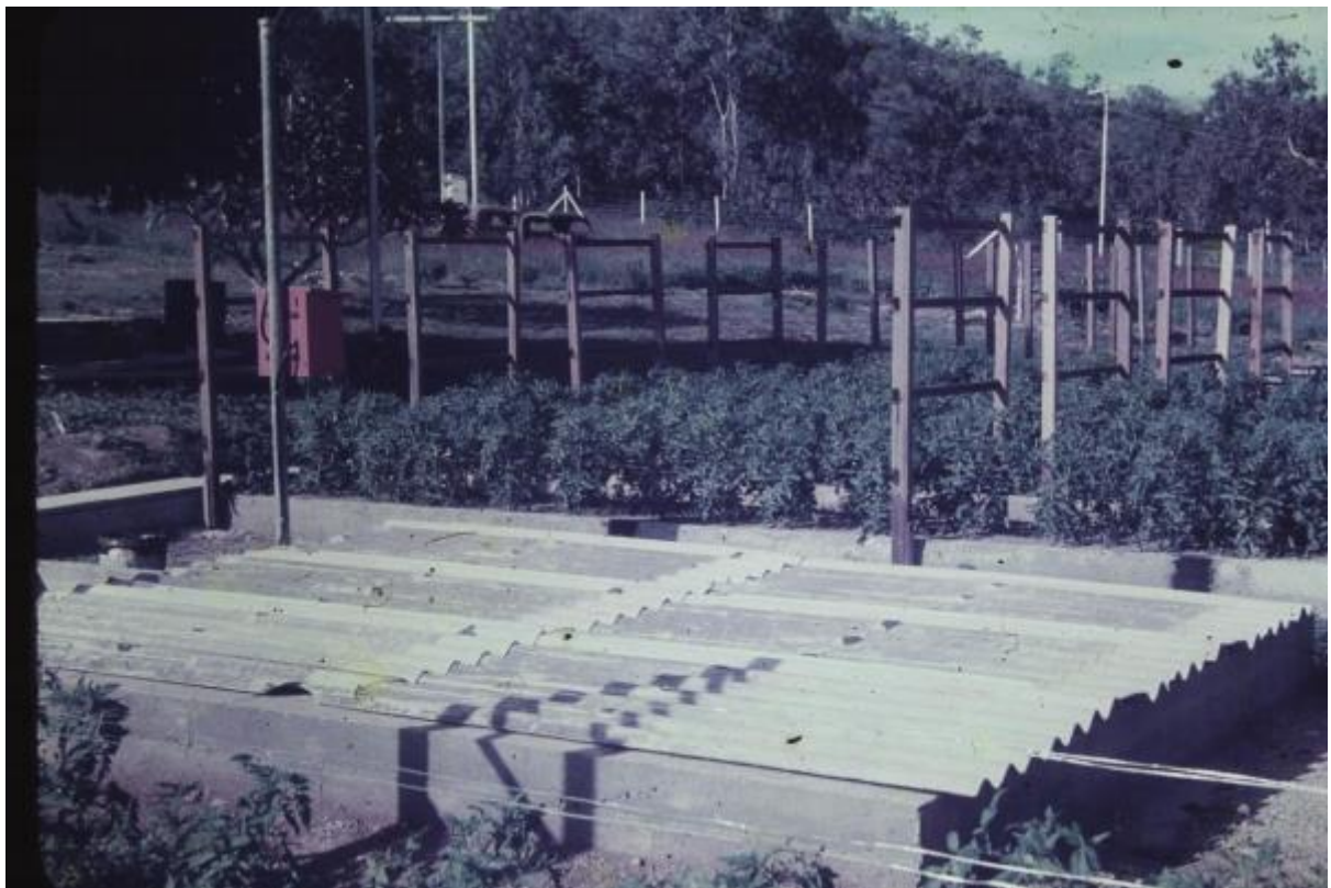
Field nursery PNG 1956