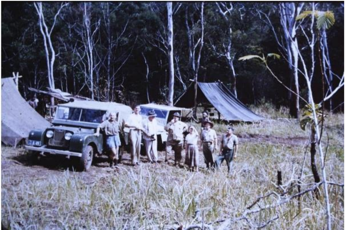
First Plant Pathology – Entomology Expedition, PNG 1956