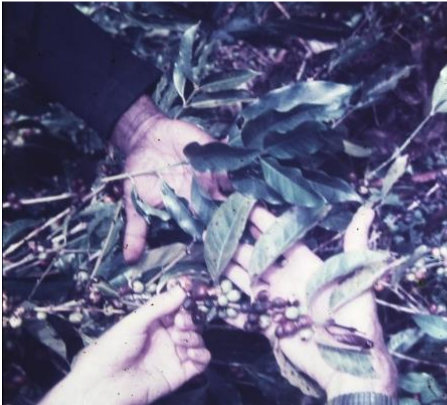
Coffee disease PNG 1956